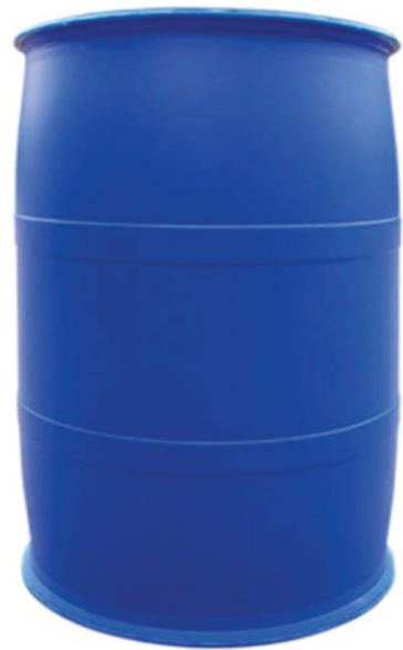
250 LITTER Close Double L Ring